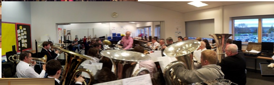
The band rehearsing on the day before the contest