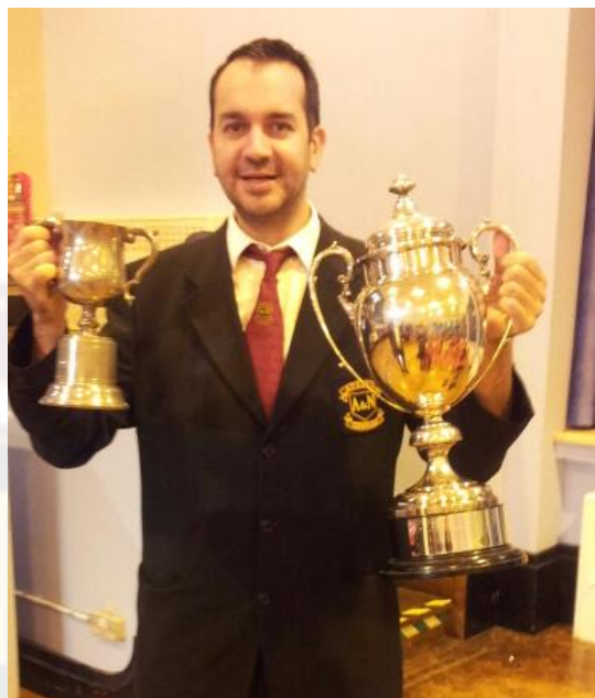
The band having just given their winning performance on stage.